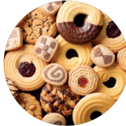
Food and feed