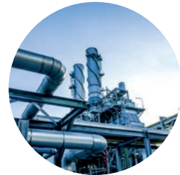
Processes and technologies